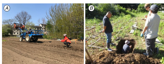
Figure 2. (A) A view of the site where the experimental site was set up, and (B) Survey of soil profile at the soil compaction treatment.

Then, each track line was divided into five blocks, where two-year-old seedlings were planted in May, and weeds were carefully removed by hand. The surface soil's physical properties were evaluated with two parameters (Figure 2): (i) soil hardness measured by a soil hardness tester (Yamanaka's Soil Hardness tester, Fujiwara Scientific Co. Ltd, Tokyo) and (ii) soil bulk density measured by a soil extraction cylinder with 5 cm of diameter (Daiki Rika Kogyo Co. Ltd, Saitama). Both physical properties were evaluated four times during May to November in 2018.