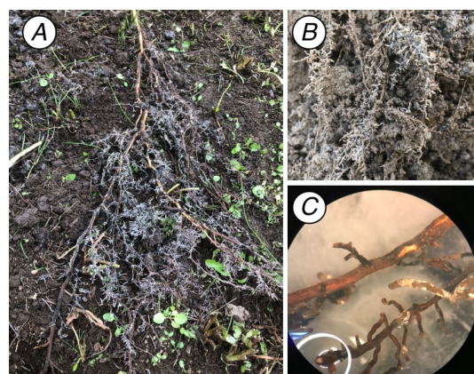
Figure 3. (A) A condition of the excavated bare roots associated with ectomycorrhizal fungi, (B) a view of its root within soil, and (C) the microscopic observation of root tips.

Height growth of seedlings was measured from planting to the end of October using a measuring tape with 0.1 cm resolution. Then, seedlings were dug up, dismantled by organ, and oven-dry weights (after 72 hours at 70°C) were measured. When digging out the seedlings, root tips were collected (Figure 3), and evaluated for the association of ectomycorrhizal fungi via the BLAST analysis (ITS region analysis of DNA) based on the protocol described in Wang et al. (2018).