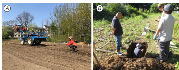
Figure 2. (A) A view of the site where the experimental site was set up, and (B) Survey of soil profile at the soil compaction treatment.

Then, each track line was divided into five blocks, where two-year-old seedlings were planted in May, and weeds were carefully removed by hand. The surface soil's physical properties were evaluated with two parameters (Figure 2): (i) soil hardness measured by a soil hardness tester (Yamanaka's Soil Hardness tester, Fujiwara Scientific Co. Ltd, Tokyo) and (ii) soil bulk density measured by a soil extraction cylinder with 5 cm of diameter (Daiki Rika Kogyo Co. Ltd, Saitama). Both physical properties were evaluated four times during May to November in 2018.