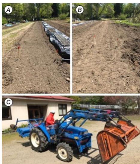
Figure 1. (A) The control plots, (B) the treatment plots of soil compaction in the experimental site, and (C) the heavy machinery weighing approximately 2.0 t used for the soil compaction.

Japan, where the soil is classified as brown forest soil (Dystric Cambisols). This experiment started in April 2018. After the tilling of the site, the treatment line was compacted by running heavy machinery, and the control line was made without soil compaction (Figure 1).